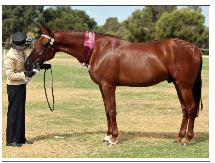
Champion Best Presented Exhibit: SP TOBIAS (Jackie Searies)