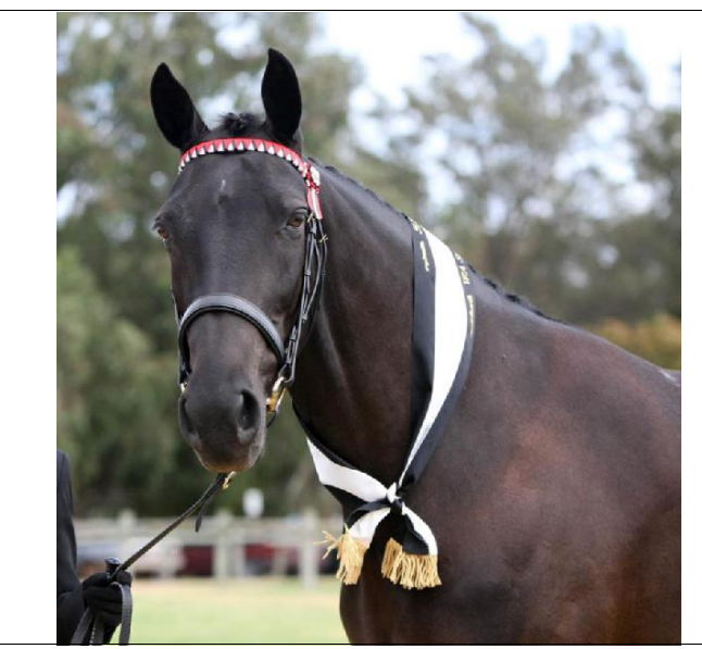
Champion Led Senior Mare: GO ALICE